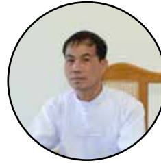
U Than Sein Register